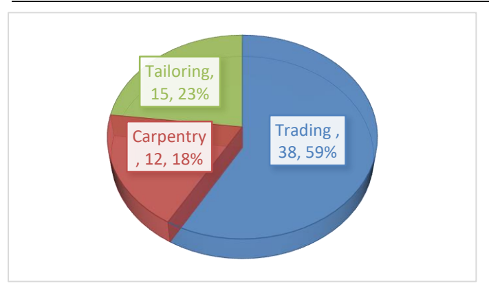
Figure 3: Pie chart showing Mallams' Responses to vocational skills learnt by Almajiris apart from the learning of Islamic and Arabic studies.