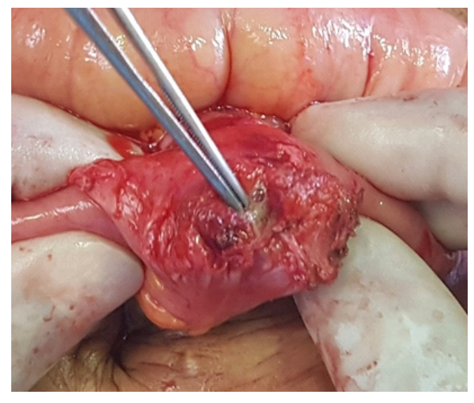
Figure 2. Densely adhered small bowel to the previous scar and fistulation (forceps)