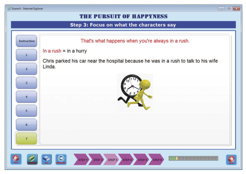
Figure 2. A screenshot in step 3

and schematize. Teachers then have more time to spend on other skills such as giving feedback on speaking or writing tasks. If the students are advanced enough and class-size allows, there could also be real meaningful conversations or tasks related to the movie content.