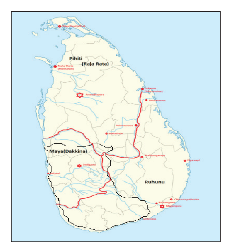
Figure-1:Map of Ruhunu, Maya, Pihiti ("Maya Rata", 2009).

Some parts of the Anuradhapura region (presently North – Central province) was belonged to the dry zone and region of Pihiti . On the other hand, most parts of the region of Ruhunu also belonged to the dry zone.But no water scarcity had emerged in the region of Maya, as it was situated in the wet zone of the country. But even in the wet zone, we could see some ancient water tanks. These water tanks were also built for the purpose of storing water. Tanks which had been built in the dry zone served the purpose of diversification of water in the agricultural grounds and also to use stored water during the off season of the territory.