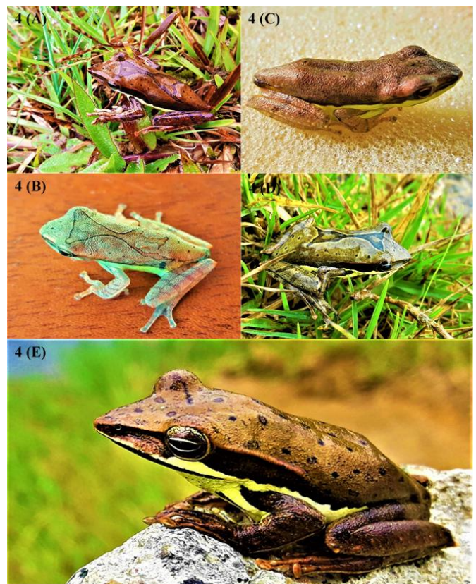
Fig 4: Variations of pattern polymorphism in T. eques species

(Figure 4B), without hour glass pattern (Figure 4C), yellow line encircled hour glass pattern (Figure 4D) and dorsal spots (Figure 4E).