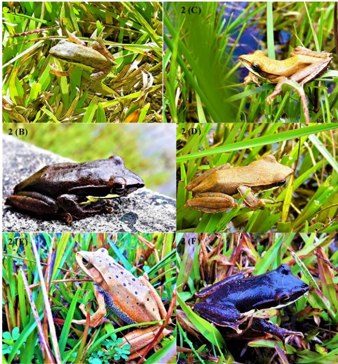
Fig 2: Colour polymorphism of T. eques recorded within and outside the HPNP

Percentages of Dark orange dorsal coloured (1.73%), cream dorsal coloured (0.29%) and purple dorsal coloured (0.58%) T. eques were very low (Figure 3).