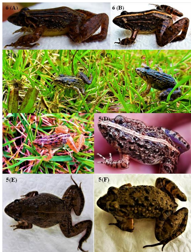
Fig 5: Variations of pattern polymorphism in M. greeni and F. limnocharis species

Highest frequency of pattern polymorphism was present as a distinct vertebral line in both M. greeni and F. kirtisinghei species. Percentages were 82.23% and 62.5% respectively. However absence of vertebral line was recorded in high frequency in F. limnocharis species (Table 3).