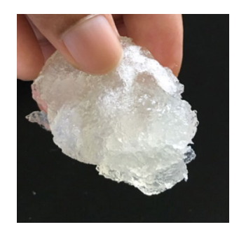
Fig. 3 Agar extracted from Gracilaria edulis

Fig. 2 Carrageenan extracted from kappaphycus alvarezii