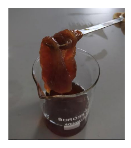
Fig. 4 Alginate extracted from Sargassum sp.

Gelatin is popular as a gelling agent in the food industry. Gelatin is derived from the parent protein collagen. Collagen containing tissues such as skins and bones of porcine, fish and bovine are used to obtain gelatin [9, 43]. Gelling temperature, melting temperature and solubility for mammalian gelatin 220 g bloom are 26–27 °C, 33-34 °C and greater than 40 °C, for cold fish gelatin are 4–8 °C, 14–16 °C and greater than 22 °C, for warm water fish gelatin are 21–22 °C, 28–29 °C and greater than 35 °C [9]. Bloom value of gelatin is a measure of the strength or the rigidity of the gelatin gel formed which is measured under standard conditions. The Bloom values of commercial gelatins are in the range of 50–300 g Bloom. A higher Bloom value of gelatin represents a higher gelling and a melting temperature and a stronger gel. The gelatins are classified as high-Bloom (200–300 g), medium-Bloom