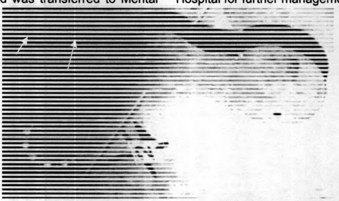
Fig. 2. The coconut scrapper: note the blade (white arrow), handle (yellow arrow) and the wooden base with blood stains, and the broken hair clip

suicidal thoughts and was transferred to Mental Hospital for further management.