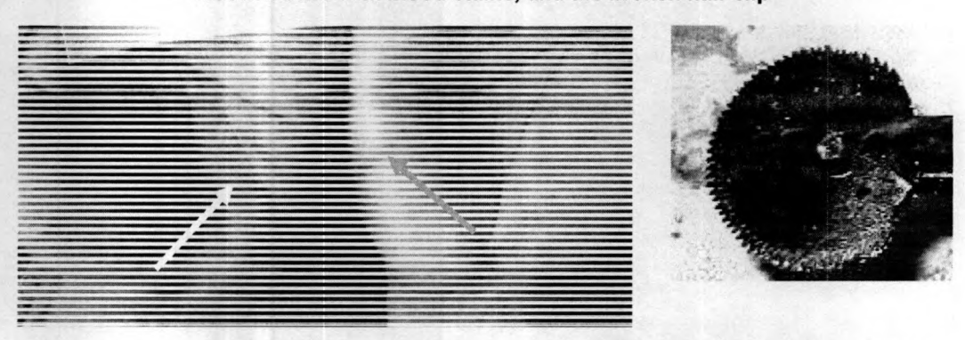
Fig. 3. Serrated abrasion on left palm (white arrow) and elongated abrasion on right palm (orange arrow) and closer view of the blade