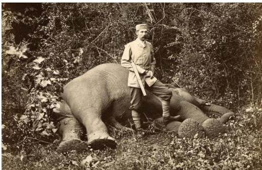
Figure 3. Franz Ferdinand with one of the elephants he killed in Kalawela, Ceylon, in January 1893.