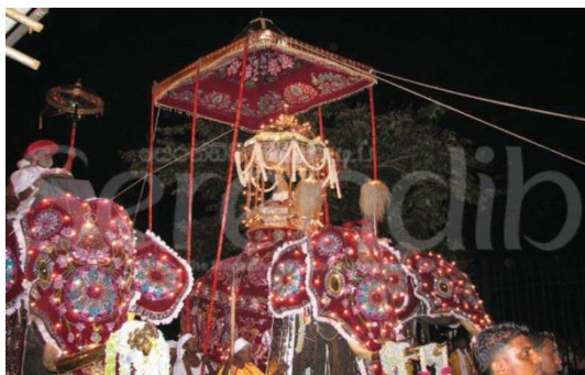
Figure 6. The Majestic Maligawe Etha carrying the casket of the sacred tooth relic.