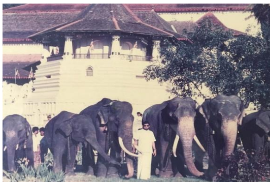
Figure 7. Diyawadana Nilame with the Sri Dalada Maligawa elephants Raja, Skanda, Jaya Raja & a few more