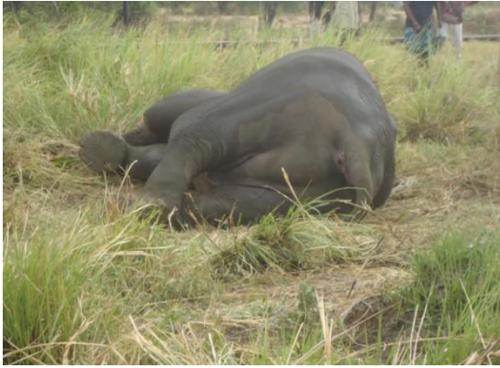
Figure 12. An elephant died by the collision with trains.