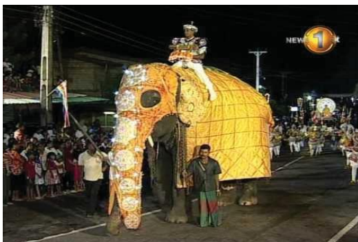
Figure 4. Peramunarala carries an ola leaf book wrapped in a piece of white cloth.