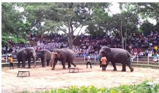
Figure 10. Elephant Dance at National Zoo, Dehiwala.