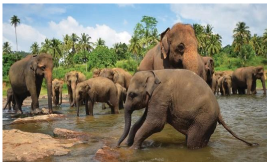
Figure 8. Elephant Orphanage in Pinnawala