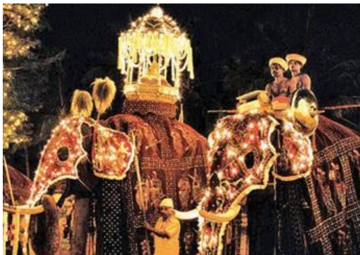
Figure 2. Kandy Esala Perahera, www.Google.lk/search?q=kandy+dalada+perahera