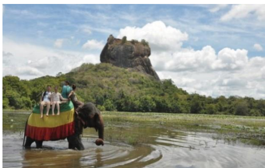
Figure 11. Foreign tourist rides an elephant during a sightseeing tour in the ancient city of Sigiriya.