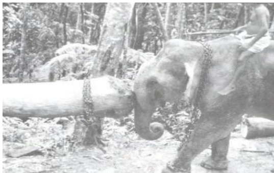
Figure 9. The elephant gently pushes the log into position on the lorry deck (FAO 1999).