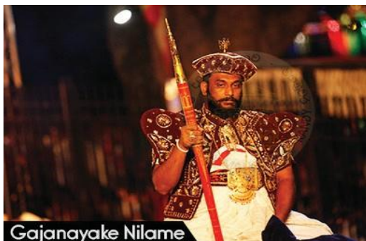
Figure 5. The Gajanayake Nilame , who wielding a goad rides on an elephant next.