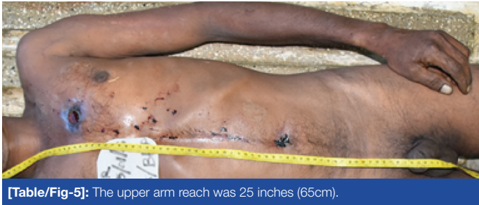
[Table/Fig-5]: The upper arm reach was 25 inches (65cm).