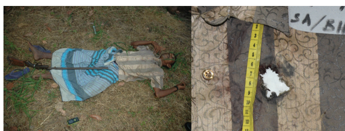
[Table/Fig-1]: The body at the scene. [Table/Fig-2]: Tear of the shirt with burnt and blackened margin with faint muzzle imprint.

Postmortem ant bites, 0.5cm x 0.5cm in size were found on the medial aspect of the right arm and 10cm x 1cm on the back of the right upper leg. Neck was free of injuries.