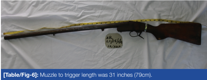
[Table/Fig-6]: Muzzle to trigger length was 31 inches (79cm).