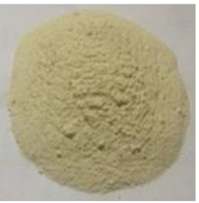
Figure 3 Casava flour.