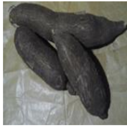
Figure 6 Cassava MU 51 tubers.

content of Kirikawadi variety flesh ranged 62.92 \pm 1.85\% in Sri Lanka which is more similar to the observed range. And also, the observed range comparable to the range of 60.3% to 87.1% reported by Padonou et al. (2005) on twenty improved cassava cultivars. As Chijindu and Boateng (2008) reported, the moisture percentage of the chips prepared in Ghana had a range of 8.0% to 9.3%which is much higher compared with the observed moisture range of 3.18% to 5.69% for different chips samples. This reduction of observed values, could be as a result of different processing methods that employed. Cassava flour had the moisture content of 12.15 \pm 0.47\% which was accordance to the codex standard (13%) for edible cassava flour ( CODEX, 1989 ).