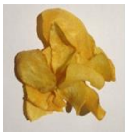
Figure 2 Small scale chips.