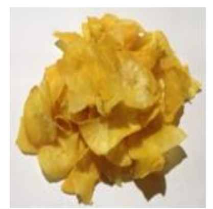
Figure 4 Large scale chips.