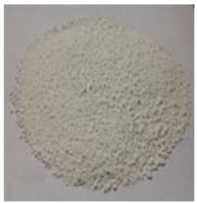
Figure 5 Cassava starch.